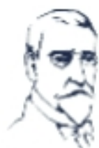
I Liceum Ogólnokształcące Im. Henryka Sienkiewicza w Kędzierzynie - Koźlu