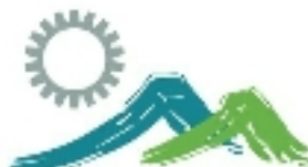
CIP "FP Lumbier" IIP