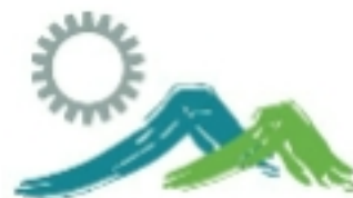
CIP "FP Lumbier" IIP